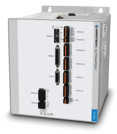
Aerotech's Automation1-XL5e panel-mount servo motor drive with high-speed optical HyperWire communication bus.