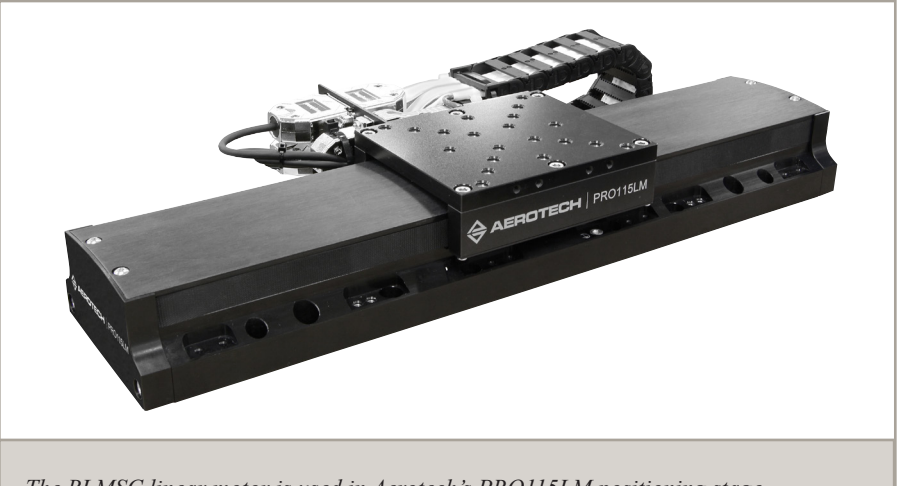
The BLMSC linear motor is used in Aerotech's PRO115LM positioning stage.